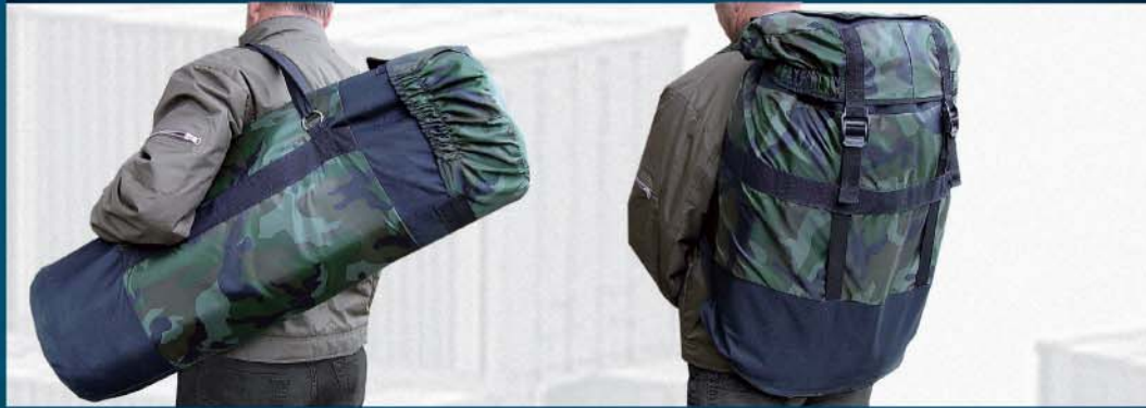
EASY TRANSPORTATION AND DEPLOYING IN ANY TERRITORY.